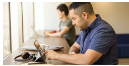
Cambridge English (FCE, CAE, CPE)