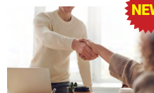
English for Professionals (30+)