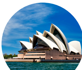
DISCOVER ILSC SYDNEY