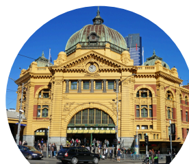
DISCOVER ILSC MELBOURNE