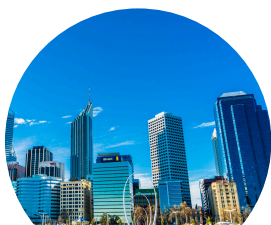
DISCOVER ILSC PERTH