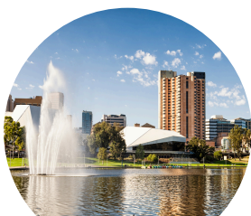
DISCOVER ILSC ADELAIDE