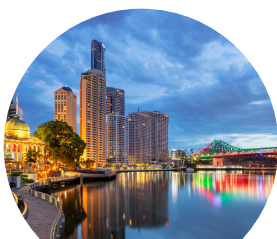
DISCOVER ILSC BRISBANE