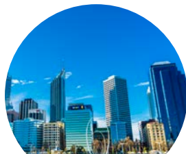
DISCOVER ILSC PERTH