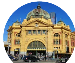
DISCOVER ILSC MELBOURNE