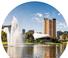
DISCOVER ILSC ADELAIDE