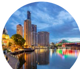
DISCOVER ILSC BRISBANE