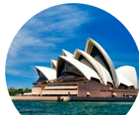
DISCOVER ILSC SYDNEY