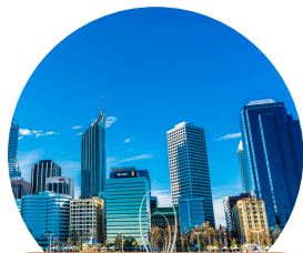
DISCOVER ILSC PERTH